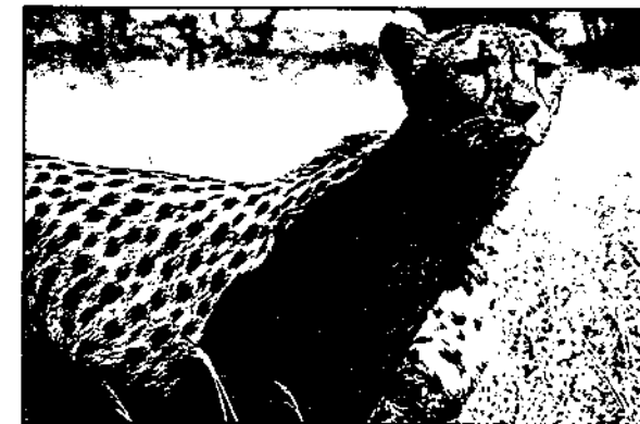
Cheetah ( Acinonyx jubatus )

Program for the Enhancement of a Valuable Species Through Sustainable Utilization