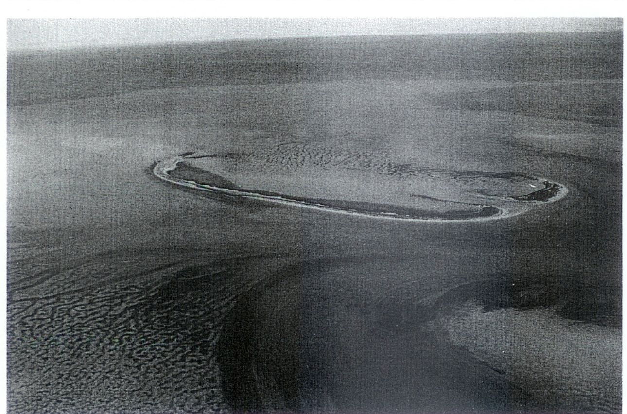
Aerial view of the Banc d'Arguin ( J. Verschuren ).

Mauritania is a very large country with a human population density among the lowest on earth. Three-quarters of the country is covered by the Sahara Desert, and useful agricultural land is