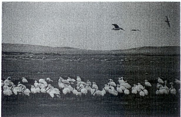
Many white spoonbills nest at the Banc d'Arguin (J. Verschuren).

What are the threats that face this exceptional natural reserve of comparable value, in global terms, to the Waddenzee in Western Europe? In the short term, it may be unfortunate that any surveillance is rather incidental, and protection is only assured in theory. The birds are safe, but guards would be essential to put an end to the poaching of the last gazelles, if indeed it is not already too late. The Parc National du Banc d'Arguin is administratively autonomous, but dependent on the Presidency of the Republic. It is hoped, therefore, that the authorities will shortly take the necessary action. A scientific research station has been established at Iwik, on the coast, in the heart of the reserve, but it is often inaccessible. All activities in the Banc d'Arguin are determined by the extreme environmental conditions: the almost total absence of fresh water, almost total desert, and the perilous sea passages between the islands.