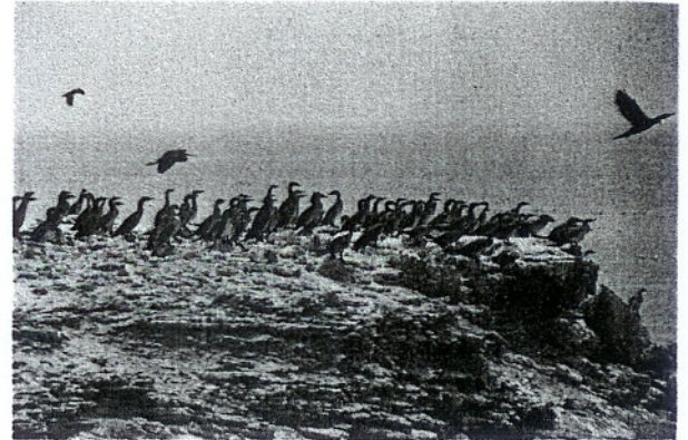
Cormorants nest in large numbers at the Banc d'Arguin (J. Verschuren).

third is coastal desert, one-third is sea and the rest consists mainly of extraordinarily high and low areas of land, which are partially uncovered at low tide: the extensive mud-flats are very productive biologically. It is also in the Banc d'Arguin that we find the northernmost mangrove swamp on Africa's Atlantic coast.