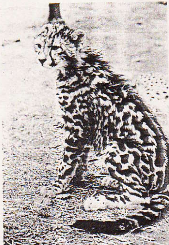
PLATE I. The first King cheetah produced at the De Wildt Cheetah Research Centre.

The ratio of King cheetahs to wild type progeny resulting from matings between the different genotypes is in accordance ( \chi^2 = 0.32 ) with the hypothesis of a single autosomal gene, where the mutant allele 'king' is recessive to the wild type allele (Table I).