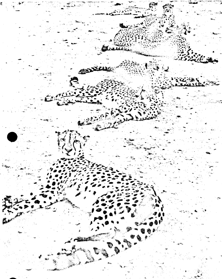
Where do we put them?