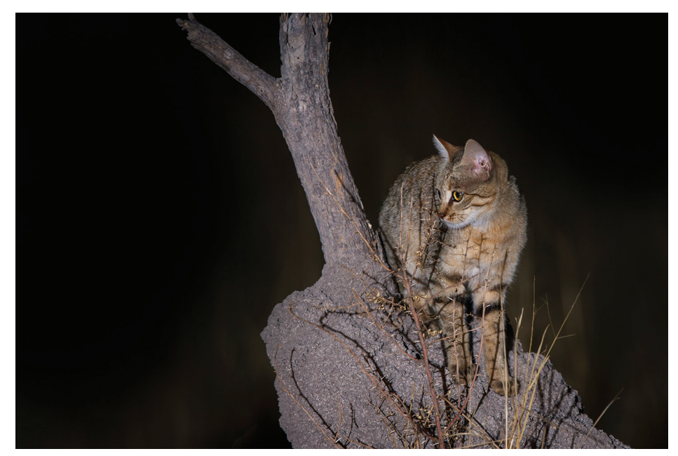
African Wild Cat