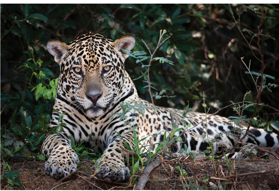
Near Threatened Jaguar, Panthera onca

Leopard ( P. p. fusca ), Arabian Leopard ( P. p. nimr ) and Cheetah ( Acinonyx jubatus ). (KSR #1)