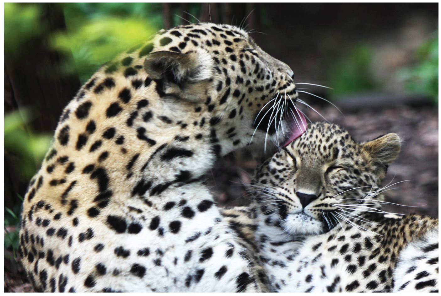
Persian Leopard (Panthera pardus tulliana)

T-058 Establish and maintain the Wild Cat Club as a group of non-members to support the work of the Cat Specialist Group. T-064 Keep the IUCN SSC website updated.