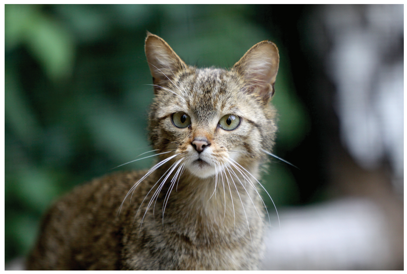
European Wildcat (Felis silvestris)

Result description: The workshop to develop the Regional Conservation Strategy has been postponed to March 2022.