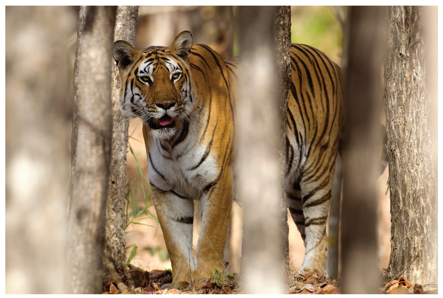
Tiger (Panthera tigris) in Pench National Park, India

spirit of the group, inform about news and/ or issues, and provide the opportunity to ask questions to the Co-Chairs and group members.