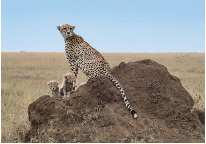
Cheetah (Acinonyx jubatus)

T-063 Participate in the project 'Act Green: A near-real-time integrated mapping and reporting system for re-wilding efforts: applying, extending and enhancing an application for Tigers (Panthera tigris) to Lions (Panthera leo), Jaguars (Panthera onca), and American Bison (Bison bison)' together with Wildlife Conservation Society (WCS), Panthera, WWF, a.o. (KSR 10)