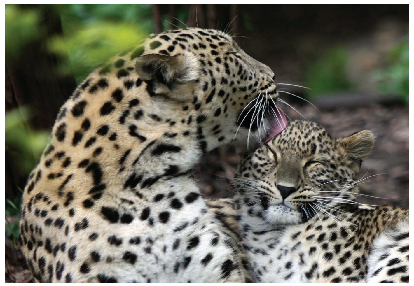
Persian Leopard ( Panthera pardus tulliana)