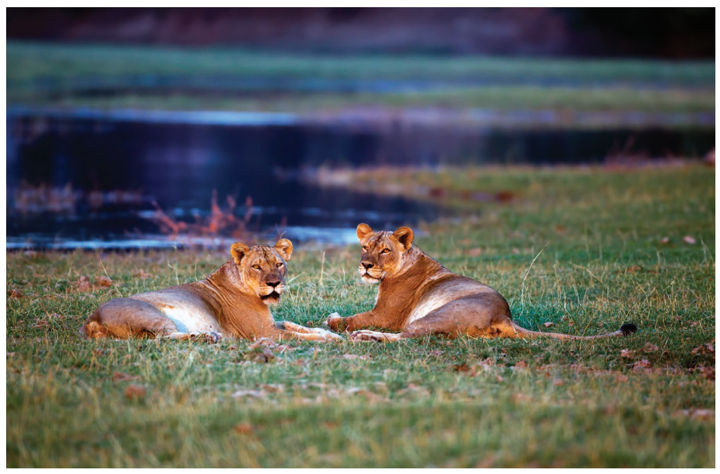
African Lion ( Panthera leo)

T-028 Maintain and expand the Cat Specialist Group Species Database (CSGSD).