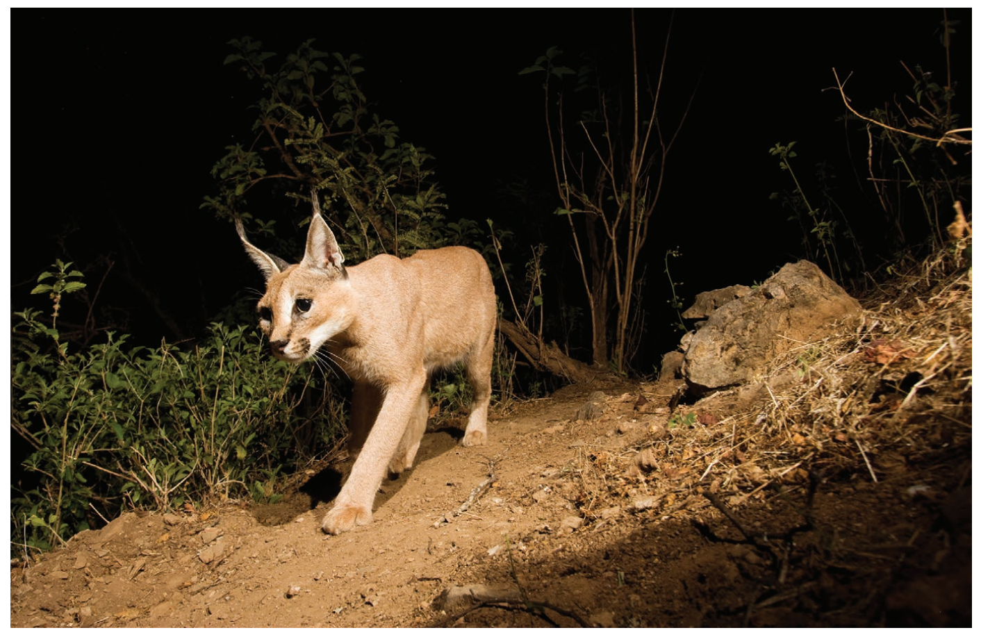
Caracal (Caracal caracal)

T-049 Explore in a discussion with the whole group, and adapt if desired, the internal structure and organisation of the Cat Specialist Group, e.g. geographic subgroups, taxonomic or topical working groups, specific task forces, etc. Status: On track