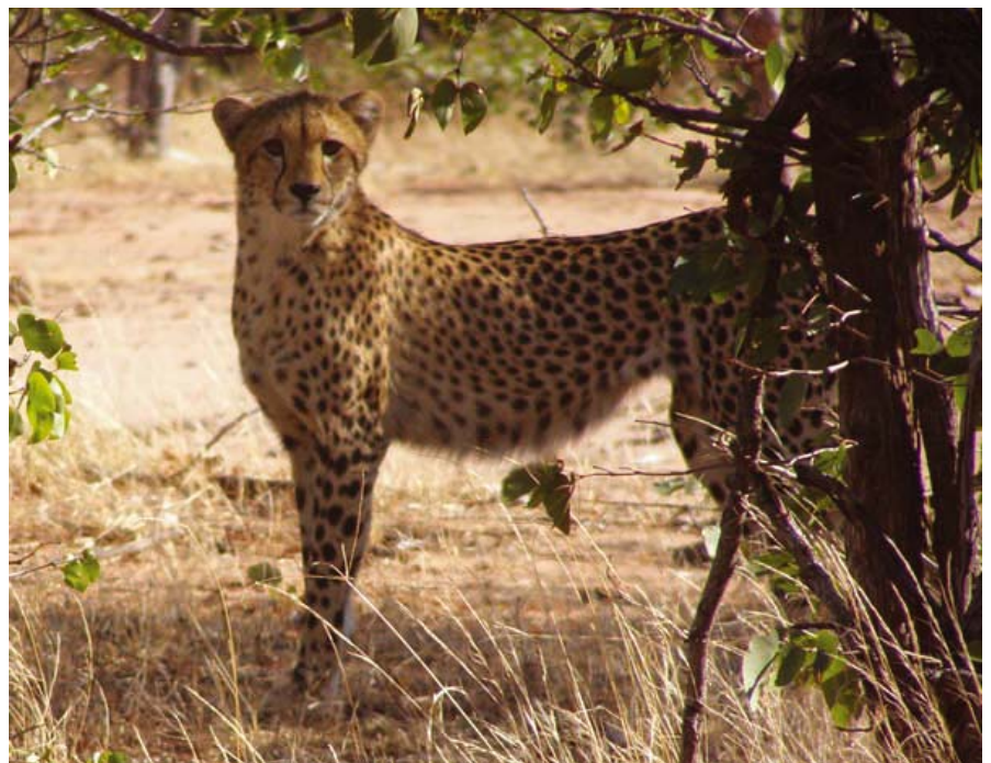
Cheetah in the Zambezi Basin (Photo Zambezi Society).

The Chimbwi plains appear to have been the centre of cheetah activity in this area, and one respondent reported