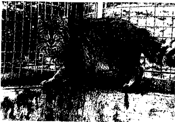
Plate 1 A Chinese mountain cat Felis bieti kept at the Wildlife Rescue Center, Xining, China.

individuals, and assessing the accuracy of each bibliographic or verbal record.