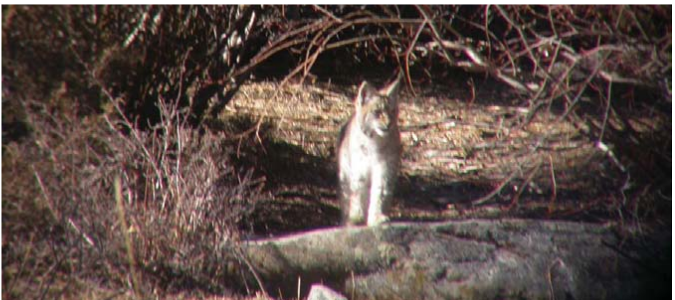
Fig. 2. Photograph of a lynx in Sichuan from February 2009.

Nature Reserve in January 2009 (unpublished data). Adult individuals spray urine around grass bases in January and February. According to interviews with reserve workers, they found 2 cubs in a litter in late May 1987, whose body length was around 40 cm and weight about 2 kg. The cubs had already opened their eyes and demonstrated attacking behaviour. The cubs were sent to the Beijing Zoo one month later. Other reports indicated that cubs were born in May and June (Gao 1987).