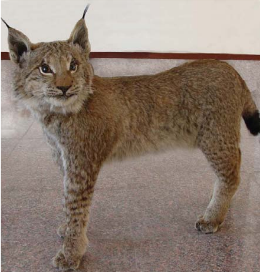
Fig. 1. Typically coloured lynx from Saihanwula nature reserve in Inner Mongolia..

The Eurasian lynx Lynx lynx attracts little attention from scientists despite the availability of funds due to the nation's economic expansion over the past few years. Only two research papers in Chinese were produced, addressing the distribution and food habits of the lynx in northeast provinces and in Xinjiang Autonomous Region (Abdukadir et al. 1998, Tian et al. 2002). With the recent implementation of the national policy for wildlife conservation and nature reserve construction, more and more land is coming under government protection. The habitat of most wild animals is recovering from unplanned mining, deforestation, and agricultural plantation. The local fauna shows hints of population recovery; however for most species, we still know little about their