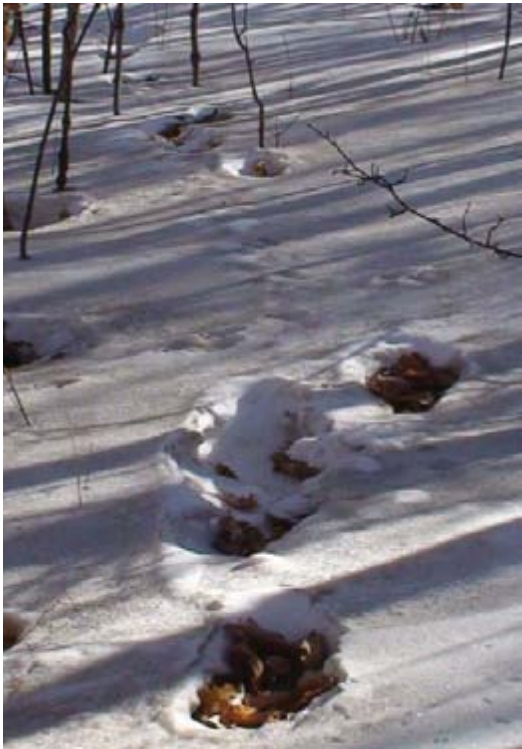
Fig. 4. The leaping traces of lynx in January, Saihanwula Nature Reserve.