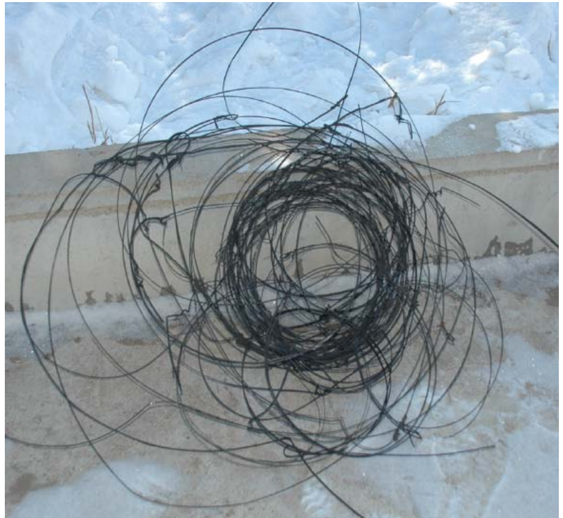
Fig. 5. Snares cleared at Saihanwula Nature Reserve, central eastern Inner Mongolia.

located and confiscated 511 snares and 3 clips. At Saihanwula Nature Reserve we conducted trap removal efforts during the winters of 2007 and 2008; over 300 snares were collected (Fig. 5). Higher penalties were imposed on 11 poachers; those snaring for hares were fined 2000 Yuan, and for deer 5000 Yuan; this is about half a year's income for local farmers. These penalties curbed poaching behaviour effectively; the footprints of lynx appeared steadily in the core protected areas during 2008. But poaching is still the primary problem for nature reserve managers.