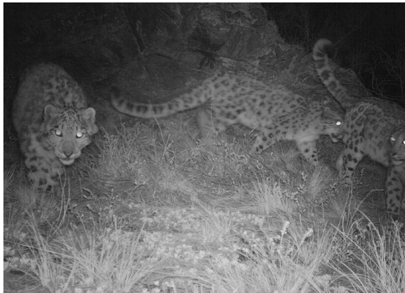
Fig. 2. A group of three snow leopards at a permanent urine spot on a rock. This is the first evidence ever obtained that snow leopards live in family groups.

There are no published data that snow leopards can reproduce every year; however, this has been demonstrated for female Amur leopards [12].