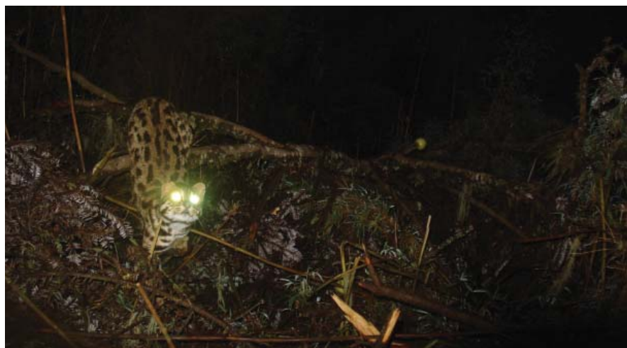
Fig. 1. During a photo trapping session in several giant panda reserves, the leopard cat was the most prevalent species. From top to bottom: Wanglang National Nature Reserve in May 2005, Xuebaoding National Nature Reserve in April 2007, Shengquozhuang Nature Reserve in August 2008 (Photos Peking University, Smithsonian National Zoo Park, World Wildlife Fund and Shanshui).

The leopard cat Prionailurus bengalensis is approximately the size of a domestic cat, but with longer legs. The tail is about 40–50% of the length of head and body. The ground colour can be a pale to a reddish or greyish yellow. Individuals from the north are pale silver grey, whereas those from the south are yellow, ochre or brownish. Especially northern individuals have black or rusty brown spots and blotches varying in size and covering their entire body (Fig. 1). The spots can form stripes on the neck and back. The underbelly and neck are white. The tail is spotted, with a few indistinct rings near the black tip (Yu & Wozencraft 1991, Sunquist & Sunquist 2002). Spot patterns vary greatly from one individual to the next.