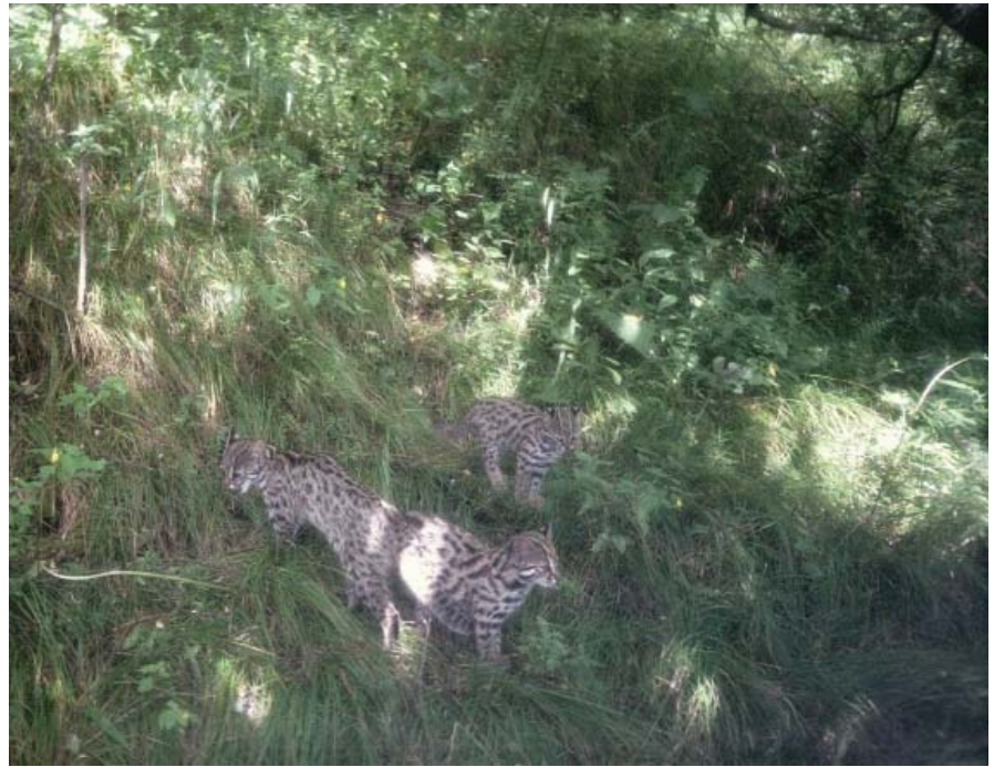
Fig. 3. On rare occasions one can also find several individuals in a group. This is a mother and her young with another adult individual. The photo was taken in Wanglang National Nature Reserve in August 2004 in Sichuan.

An international call in 1992 discouraged leopard cat fur import from China until the following conservation recommendations were implemented. These recommendations included: (1) adequate protection should be provided by provincial or national legislation, clarifying the legal status, controlling wild harvests and exports and enforcing quotas, as well as regulating international trade; (2) all inventory stockpiles should be labelled with the company name and numbers of skins as they are inventoried (not as they enter trade); (3) where trade is illegal, prohibitions should be enforced by provincial Forestry Bureaus; (4) in-depth studies of the relationship between the number of animals harvested and harvest effort (mostly in Guizhou and Yunnan)