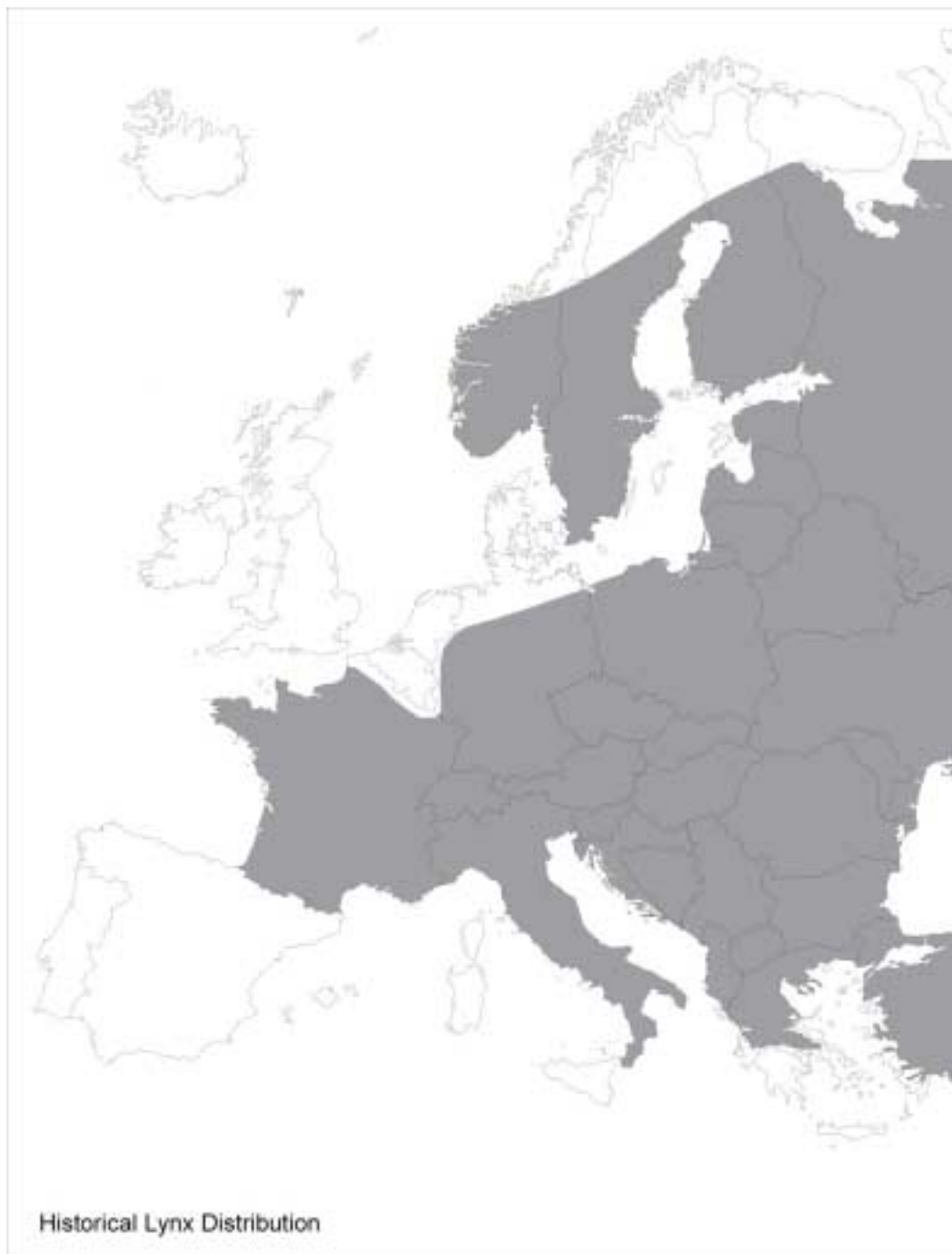
Figure 1. Historical distribution of Lynx lynx in Europe according to Kratochvil et al. (1968). The distribution given is hypothetical, based on the fossil record (which we have not re-examined) and on the assumption that forests were the ultimate lynx habitat. The Iberian Peninsula was excluded as the Pyrenees are believed to be the border line between the distribution of L. lynx and L. pardinus , though the sympatric occurrence of the two species never has been clarified.