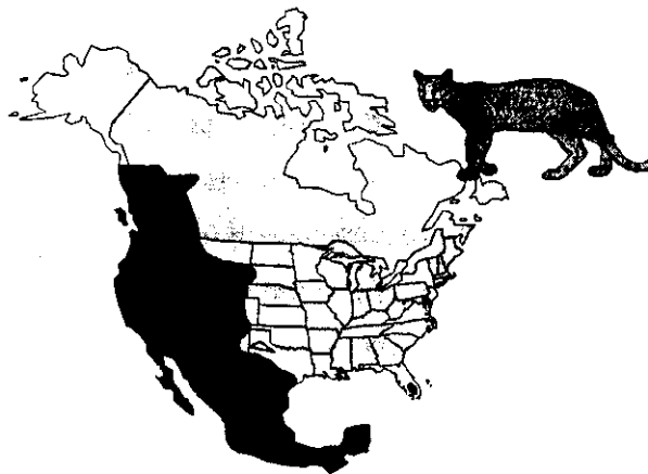
Fig. 1. Current range of the cougar in North America.

Cougars historically had the broadest geographic distribution of any wild mammal in the Western Hemisphere, ranging from northern British Columbia to the tip of South America, and from coast to coast across both continents (Goldman 1946). From the 1700's through the early 1900's, heavy hunting and predator control efforts resulted in the reduction or elimination of many cougar populations. Since the late 1800's, cougars have been rare or absent from the eastern half of North America (Fig. 1).