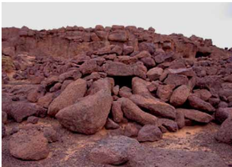
Fig. 2. A leopard trap (called margabah by the local population) Eastern Desert – Jordan.

have been rumours of leopards crossing the borders from the Saudi side and Palestine, but a recent short field visit could not confirm these. However, in one area close to Dana Nature Reserve in Tafilah, habitats are still relatively untouched and seem to be very suitable for leopards due to the rugged landscape and presence of wadis and rocky cliffs which might provide very good shelter and forage for leopards. This is also the area where the last sighting of leopards came from. It is recommended to survey this area thoroughly and place some camera traps if possible.