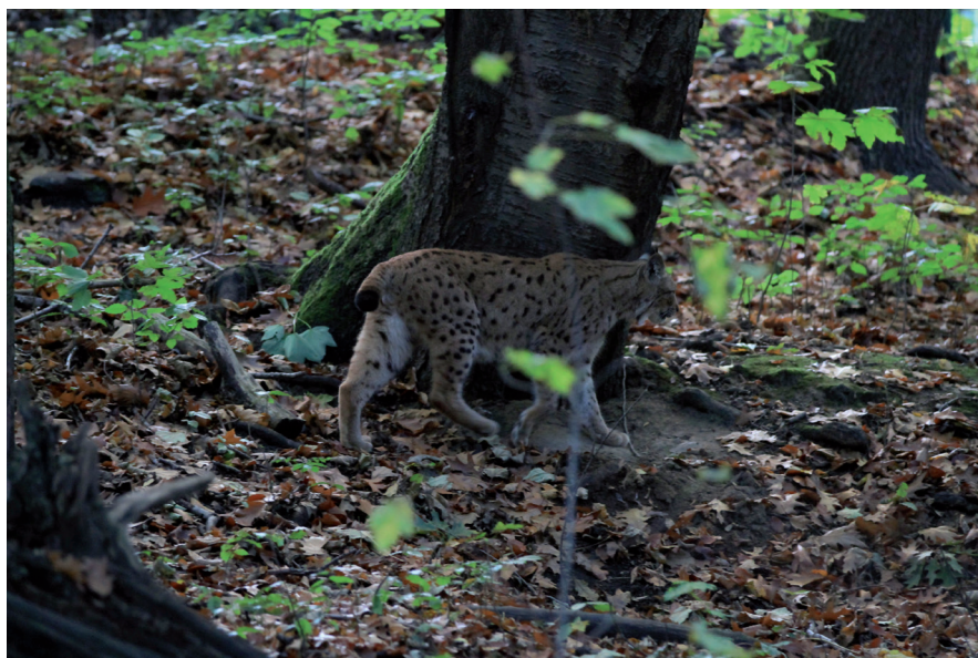
Fig. 1. Carpathian lynx male in Dortmund Zoo.

Beside reintroducing populations to former distribution areas, the genetic restoration of existing wild lynx populations could be a future scenario for the use of captive animals (Bonn Lynx Expert Group 2021). Therefore a full genetic evaluation of the current zoo population is needed, as in the past some individuals of unknown parentage were assumed to be of pure subspecies origin based on phenotypic traits (Versteeg 2009). Besides their phylogenetic origin, the genetic variability (e.g. heterogeneity) of the zoo populations compared to the wild source populations needs to be known and considered. We are convinced that zoos could play a significant role in the efforts to restore or remedy lynx populations in Europe. Zoo-born lynx would have, compared to wild-caught specimens, some considerable advantages,