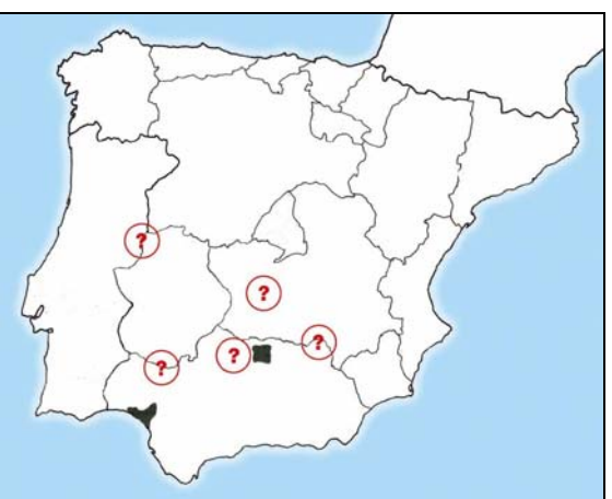
Illustration 2. Lynx population in 2002