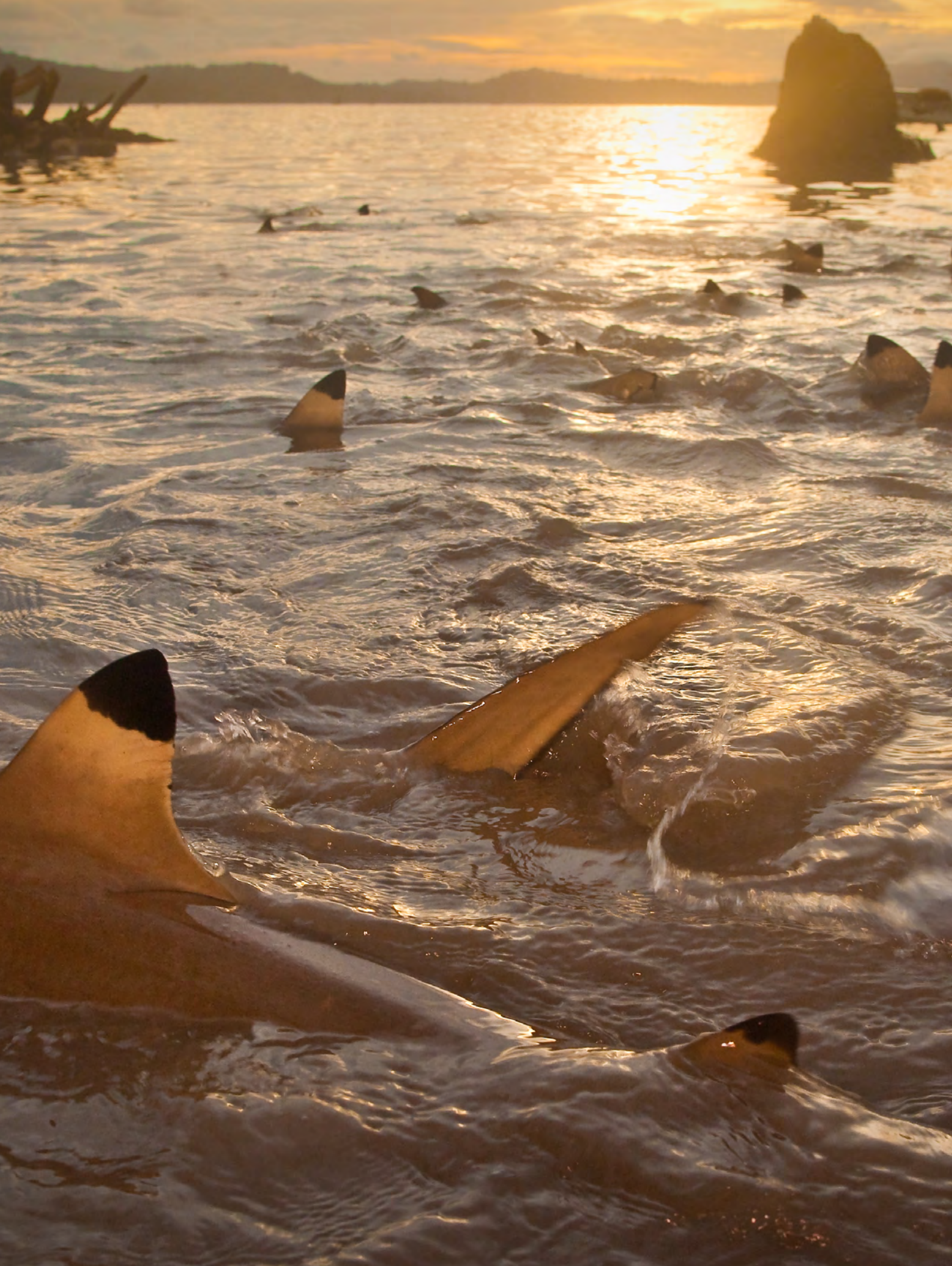
Black-tipped reef sharks ( Carcharhinus melanopterus )