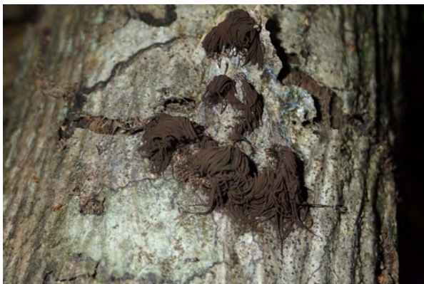
Stemonaria longa in Guadeloupe

In this Standard, a Fully Recovered species is defined based on viability, functionality, and representation (see definition in section III). Viability is the first requirement that is essential but not sufficient for recognising a species as recovered. To be considered Fully Recovered, a species must also exhibit its ecological interactions, functions, and other roles in the ecosystem, and occur in a representative set of ecosystems and communities throughout its range. The viability and functionality aspects are addressed in the assessment of the state of the species' population in each spatial unit (see sections IV.1, V.3.c and V.3.d), and the representation aspect is addressed by making the assessment in all spatial units across the species' range (see sections IV.1 and V.2). The definition based on these characteristics is used to measure a species' recovery, expressed as the Green Score, which in turn is used to define four conservation impact metrics to quantify the importance of conservation for the species (see section III, Definitions).