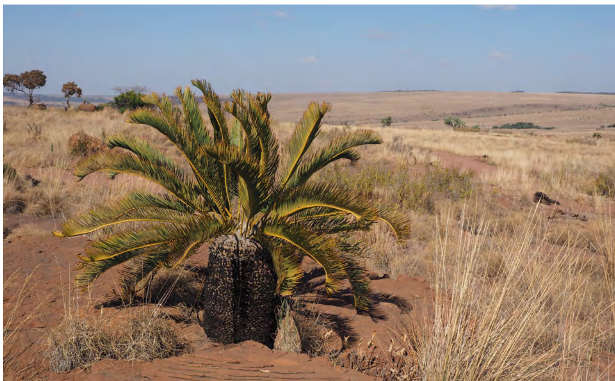
Woolly cycad ( Encephalartos lanatus )

Many restricted range species may be assessed based on a single spatial unit, or two spatial units (e.g. one for the extant range and one for the extirpated range). This may also be the case for a species that has always existed in a very specific type of ecosystem or a species whose function is similar in the different ecological settings it exists in. For other species, three or more spatial units may be necessary to represent the variety of ecological conditions and contexts that the species occurs or has occurred in.