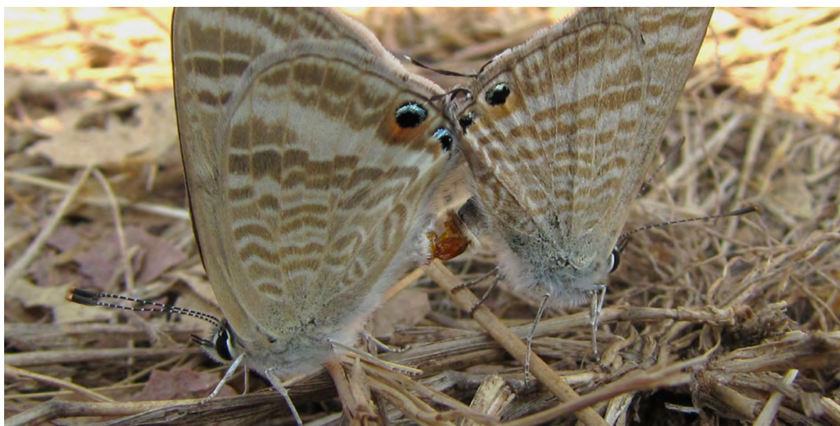
Mating of Pea Blue ( Lampides boeticus )