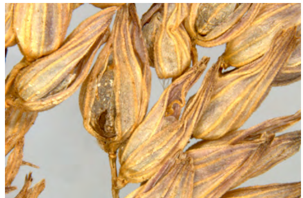
Ustilago suddiana