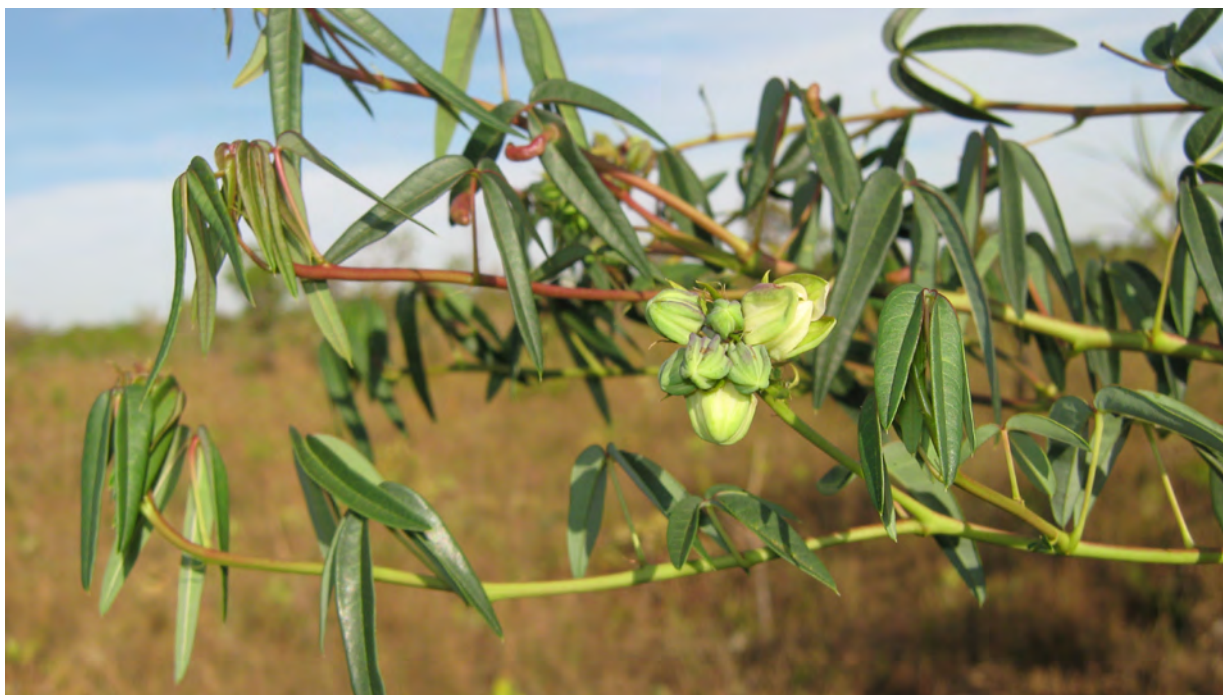
Manihot gracilis Pohl, a secondary genetic wild relative of cassava ( M. esculenta subsp. esculenta ), in Brazil