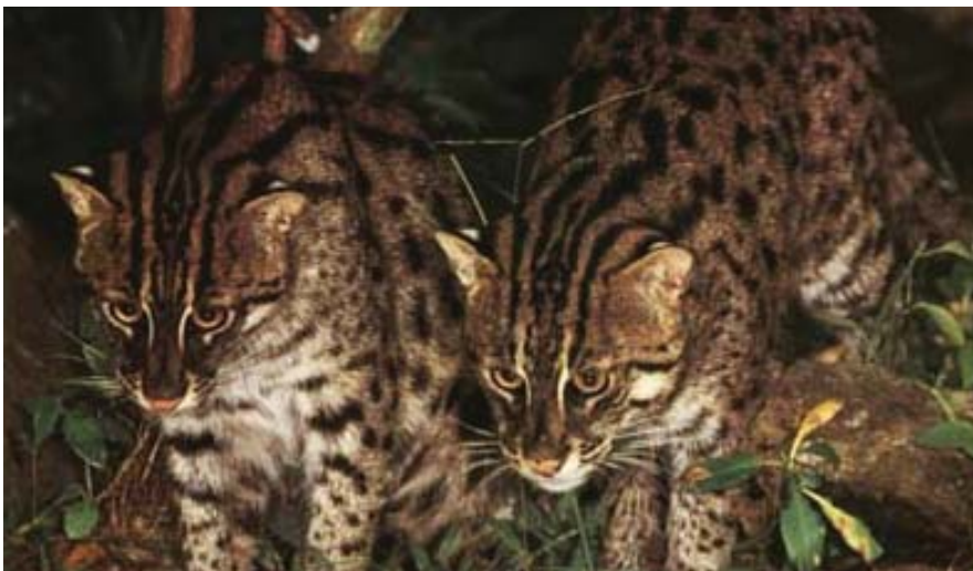
Fig. 1. Fishing cats stalking prey (top, photo N. Buck; bottom, photo Art Wolfe).