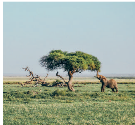
Image Credit: Amboseli National Park, Kenya. Photo by © Harshil Gudka on Unsplash

The data are used to examine the natural resources of countries and to calculate factors such as environmental sustainability.