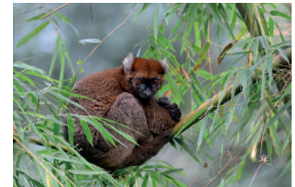
Greater Bamboo Lemur ( Prolemur simus ) - Critically Endangered

The IUCN Red List assessment of all 103 known lemur species in Madagascar in 2012 led directly to a conservation strategy attracting a USD 7.65 million investment, which is protecting many lemur species through IUCN SOS—Save Our Species.