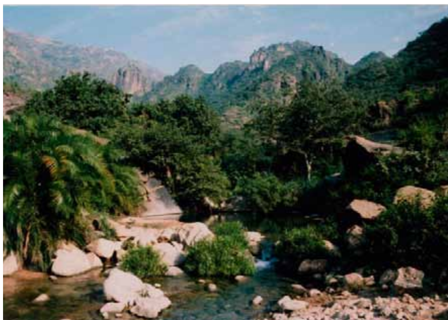
Fig. 3. Bura'a in the western mountains of Yemen.

The climate is generally hot, though modified by altitude. Frost and snow are not uncommon in winter at high elevations (Cornwallis & Porter 1982). Precipitation may reach 650 mm annually in the western highlands, with rainy