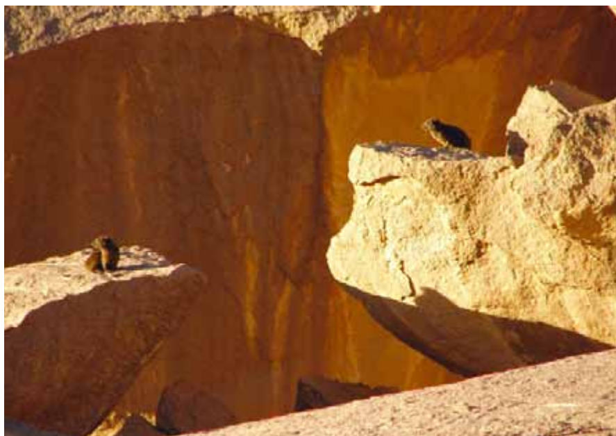
Fig. 4. Rock hyrax have been identified as leopard prey. They are widespread in Yemen.

Al-Jumaily 1998) and some do not occur in leopard habitat. It is also unclear whether these species could form a significant part of the diet or whether they would only constitute an occasional prey item. Potential prey also includes birds such as partridges Alectoris philbyi , A. melanocephala and Ammoperdix heyi , sandgrouse Pterocles spp. and other ground-living birds, as well as larger reptiles such as Uromastyx spp. Leopards are known to prey on livestock but there are few details on the frequency of attacks or extent of depredations.