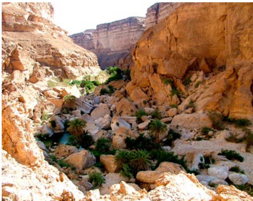
Fig. 2. Wadi Hadhramout in Yemen (Photo P. Vercammen).

There are no estimates of past or present numbers, but the population is generally considered to be small and fragmented. The few published sources agree that leopards are rare in Yemen. El-Mashjary (1995) said that large mammals had been seriously depleted during the 20 th century and that leopards were rarely seen. Stuart & Stuart (1996) suggested that leopard numbers were very low. Al-Jumaily (1998) said that leopards could be close to extinction. The current population trend is assumed to be declining, based on reductions in prey species and the scarcity of reports.