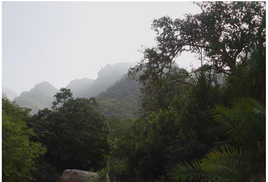
Fig. 5. Bura'a in the western mountains of Yemen.