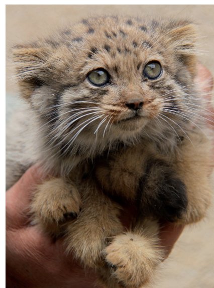
Fig. 5. A Pallas's cat cub perceived as a leopard cub and captured by a local herder in Tandoureh NP in April 2014 (Photo A. Moharrami).

Khbr NP, Yazd Province) or leopard cub (e.g. Tandoureh NP, Razavi Khorasan Province; Fig. 5). Recent conservation prioritization analysis based on evolutionary distinctiveness and globally endangered score has given the Pallas's cat a high priority for research and conservation actions in Iran, i.e. first ranking among Iran's lesser cats and one of top ten country's carnivore species (Farhadinia et al. 2016).