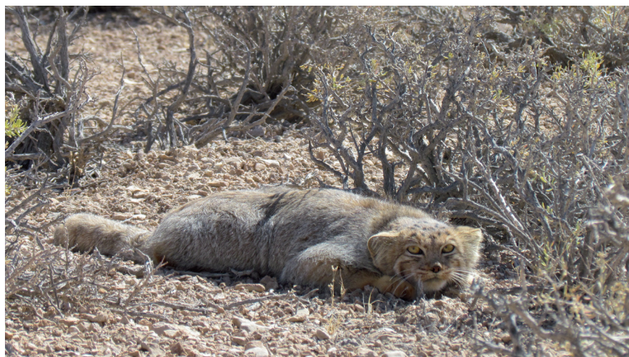
Fig. 3 A Pallas's cat in Khosh Yeilagh WR in September 2015.

The Pallas's cats feed mainly on small rodents and lagomorphs, in particular pikas of genus Ochotona . Moreover, small ground birds, hedgehogs, lizards and invertebrates are occasionally hunted. According to Heptner & Sludskii (1972), the manul's habitat is also typified by the presence of pikas and other small rodents, which constitute the bulk of its prey. The authors found remains of pikas in 89% of scats. In Mongolia, Ross et al. (2010b) recorded the manul feeding on a broad range of prey from insects to small mammals and birds. Nonetheless, diurnal pikas were highly