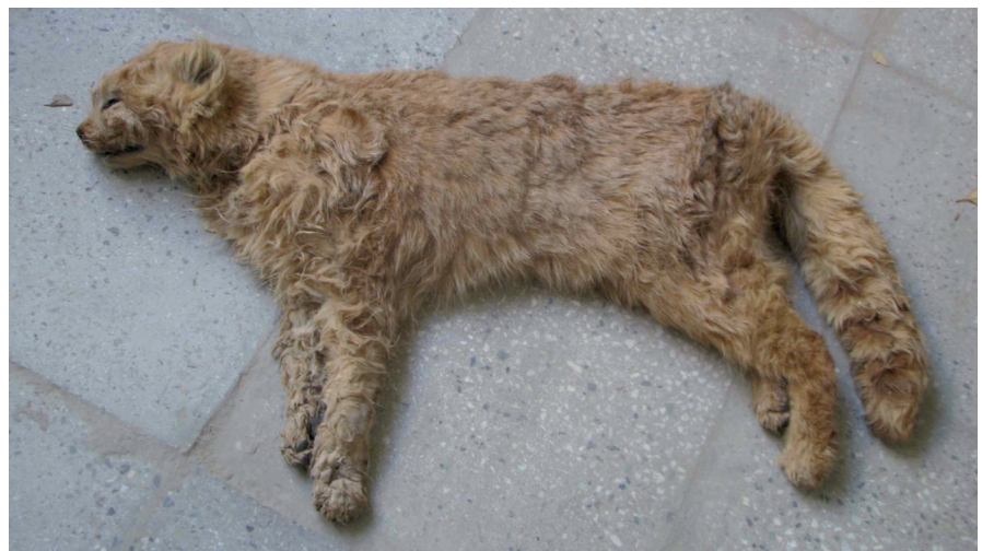
Fig. 2. Carcass of an erytristic morph of the Pallas's cat in Bafq, Yazd Province, in January 2008 (Photo Yazd DoE).

According to Rustamov & Sopyev (1994), the manul also exists in southern Turkmenistan, neighboring north-eastern Iran. Pocock (1939) also reported a specimen from east-