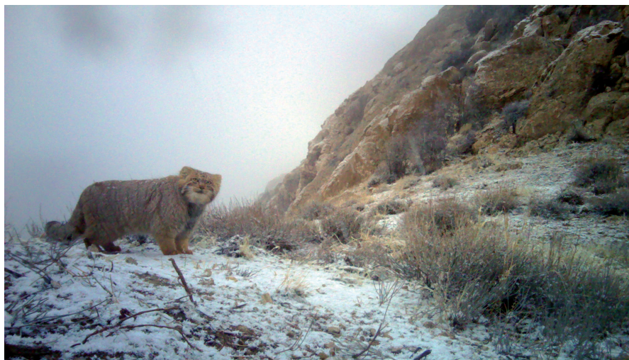
Fig. 1. A Pallas's cat photo-trapped in Salouk National Park, North Khorasan Province, in fall 2015.

The taxonomic status of the Pallas's cat was unclear until very recently. At first, on the basis of the coat appearance, Peter Simon Pallas postulated that the manul is a likely ancestor of Persian domestic cat breeds (Nowell & Jackson 1996). Later authors classified the species as Lynx , Felis , and subsequently in its own genus. Today, Otocolobus is believed to be a monotypic genus. Novel molecular studies have suggested a very close phylogenetic relationship with the Prionailurus lineage (Johnson et al. 2006). Three subspecies are proposed to date: O. m. manul (Pallas 1776) in Russia, Mongolia and northern China; O. m. nigripictus (Hodgson 1842) on the Tibetan Plateau and probably Kashmir; and O. m. ferrugineus (Ognev 1928) from Central Asia to Iran. While the eastern subspecies is the typical greyish morph, the western population shows a variably rufescent coat colour (Nowell & Jackson 1996; see Figs. 1-3).