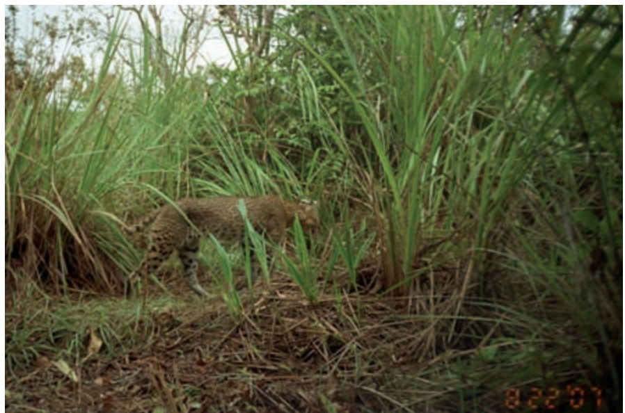
Fig. 2. Camera trap photograph of the servaline morph of the serval, Odzala NP, August 2007 (Photo P. Henschel, Panthera).

Despite persistent rumors about the continued presence of lions in Odzala and in the Batéké Plateau in southern Congo and