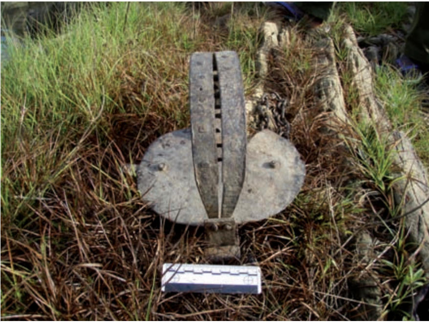
Fig. 3. Large steel gin trap found in a poacher camp in Comoé NP, northern Côte d'Ivoire, April 2010. Scale measures 10 cm.

senting 12 individuals, nobody had heard or seen lions in recent years; the last observation from these reports dated to 2004.