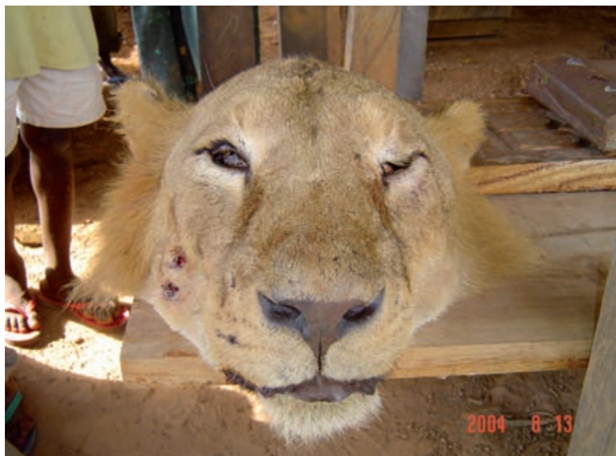
Fig. 4. Photograph of lion killed by local hunters at the edge of Mole National Park in August 2004.

in Mole, including two large carnivores (leopard and spotted hyena) and one other felid (caracal Caracal caracal ). The frequency of lion sightings by park patrol staff declined significantly over the 40-year period of monitoring, from a high of ~2 lions/100 patrols in the early 1970s down to only three sightings between 2004-2008 (~0.1 lions/100 patrols; Burton et al. in review). Among interview respondents, only 11% reported having seen a lion within the last five years, and 48% of respondents expressing familiarity with lions suggested that the species had declined or no longer occurred in the area. Nearly three-quarters (73%) of respondents indicated that lions were used for traditional purposes (such as ceremonial skins, food and medicine), and 45% reported livestock depredation due to lions. Official park reports documented two instances of human-lion conflict in 2004 that resulted in at least one lion being illegally killed (Fig. 4).