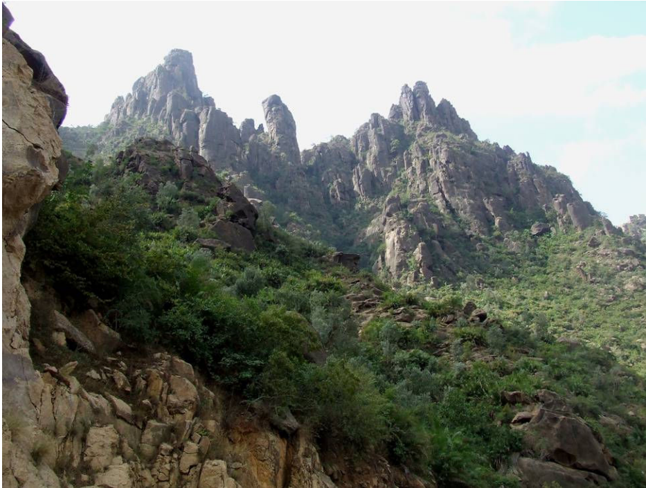
Fig. 8. Bura'a PA