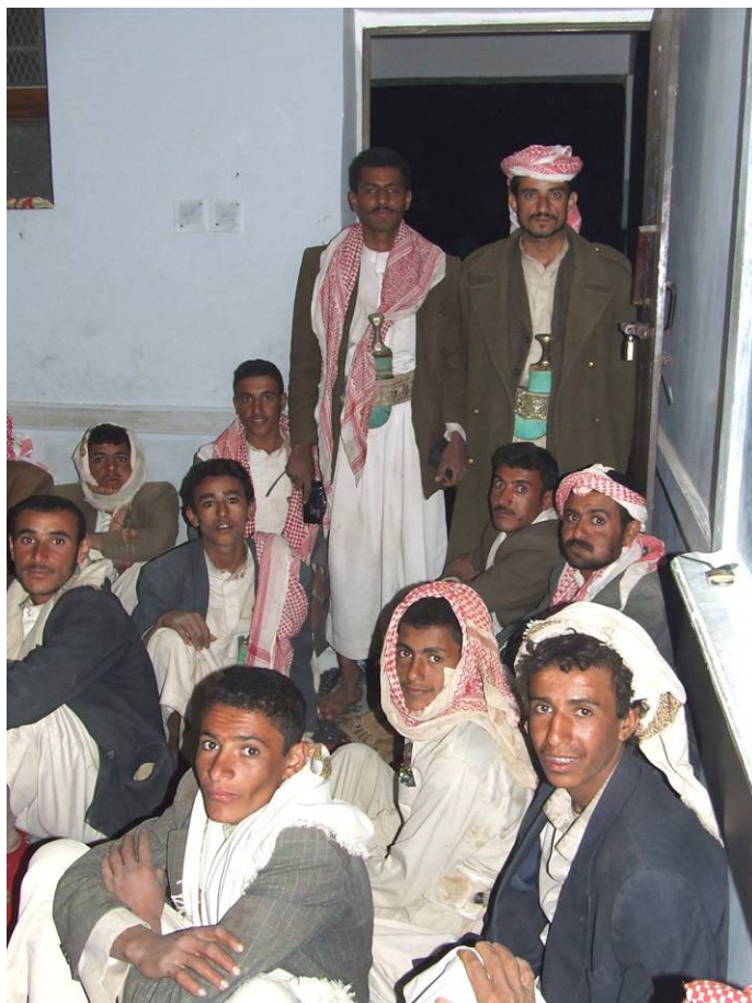
Fig. 6. Village meeting in Al-Dhil'ain