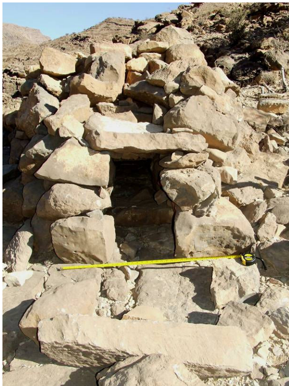
Fig. 5. Margaba – front view

Stone traps called margaba are used in several parts of the Arabian Peninsula to catch leopards, but local people insisted that Wada'a was the only place in Yemen where these traps were used. These traps measure about 3m in length and are up to 0.75m high (Figs 4 & 5). Bait is placed at one end and when the leopard seizes this, a stone door is released, trapping the animal inside. Once caught, the leopards are transported to the village in a steel box. One steel cage trap has also been used occasionally. The margaba are sited at several points in the wadi bed and on the sides. Trapping was carried out by two families, one in Ad Dhil'ain village and one in Al Howbeh. The two principal trappers acted as guides on the foot surveys and both were interviewed in detail. Hussain Ali Saleh said he had caught 10 leopards and Hussain Ibn Hussain Abu Hassan has caught four. The last leopard was trapped 3 years ago and they both assured us that trapping had completely ceased in Wada'a. The five margaba examined were all inoperative.