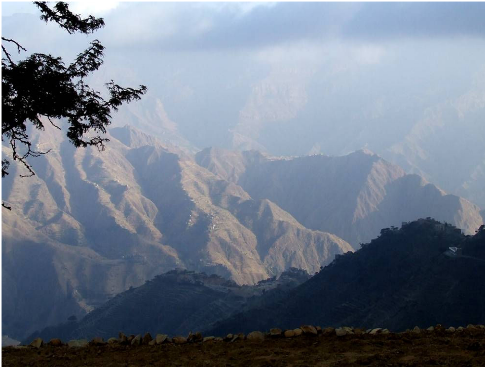
Fig. 7. Maswar area and Wadi Dhulum

Wadi Dhulum is situated in Maswar district, south-west of Wada'a and also in Amran governorate. The wadi is very steep and rugged but almost all the adjacent mountain slopes have been terraced for agriculture and the area is now heavily settled. The leader of the local administration and several villagers were interviewed: all confirmed that leopards had formerly occurred in the wadi but had disappeared from there and the Maswar region with the expansion of human settlement and agriculture. There had been no signs or reports of leopards for at least 10-15 years.