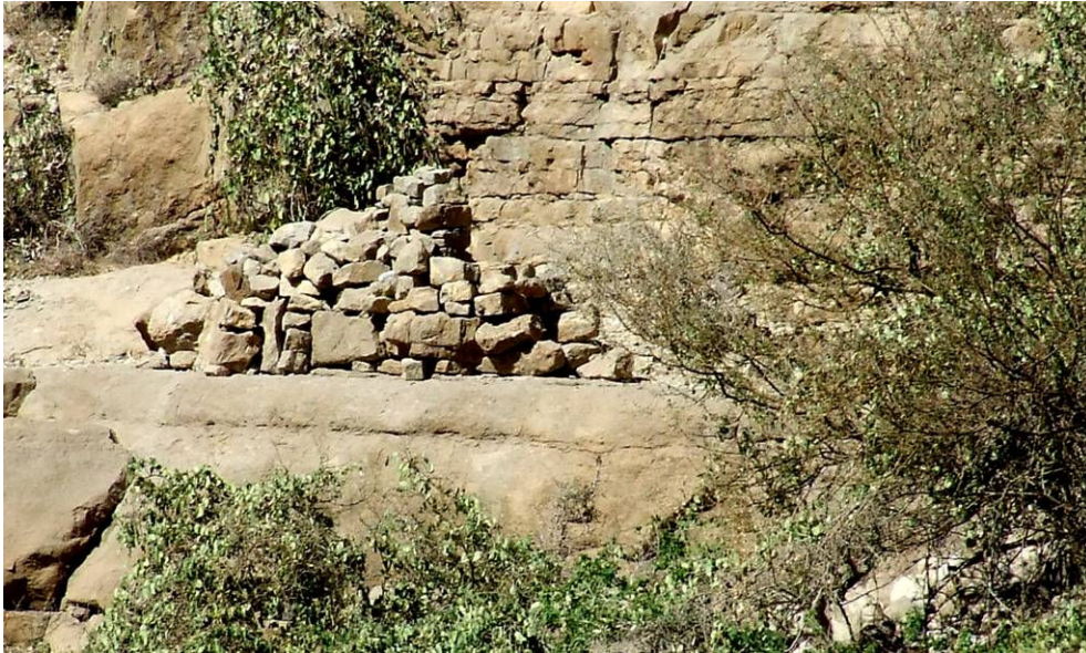
Fig. 4. Margaba – leopard trap

Stone traps called margaba are used in several parts of the Arabian Peninsula to catch leopards, but local people insisted that Wada'a was the only place in Yemen where these traps were used. These traps measure about 3m in length and are up to 0.75m high (Figs 4 & 5). Bait is placed at one end and when the leopard seizes this, a stone door is released, trapping the animal inside. Once caught, the leopards are transported to the village in a steel box. One steel cage trap has also been used occasionally. The margaba are sited at several points in the wadi bed and on the sides. Trapping was carried out by two families, one in Ad Dhil'ain village and one in Al Howbeh. The two principal trappers acted as guides on the foot surveys and both were interviewed in detail. Hussain Ali Saleh said he had caught 10 leopards and Hussain Ibn Hussain Abu Hassan has caught four. The last leopard was trapped 3 years ago and they both assured us that trapping had completely ceased in Wada'a. The five margaba examined were all inoperative.