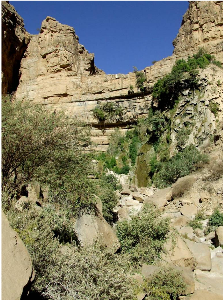
Fig. 3. Upper section of Lafaj Al Yamani

There is no habitation in the wadi. A few terraced fields have been constructed at one point but are now abandoned. Livestock are sometimes taken to the wadi to graze and herders may stay overnight, using rock overhangs as shelters for themselves and their animals. No livestock and few signs of grazing were seen in the upper part of the wadi.