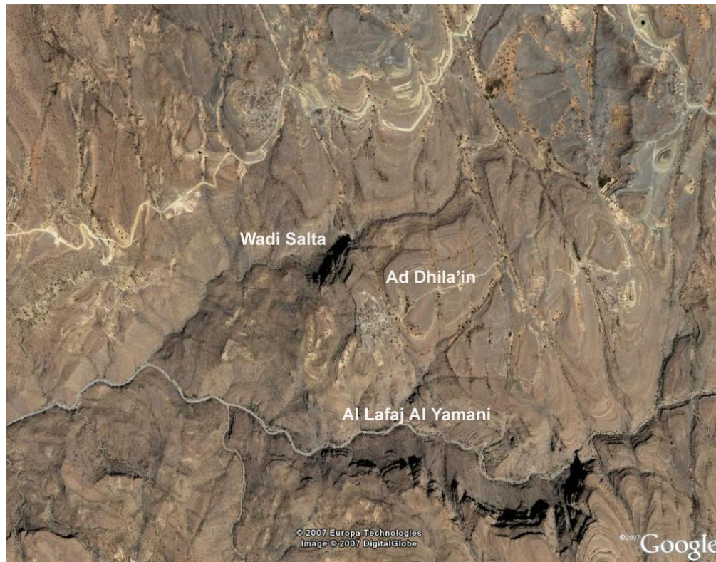
Fig. 2. Google Earth map of Wada'a field site.

Wada'a is a sub-district of Amran Governorate, situated north-west of Khamir in the western highlands of Yemen and covers an area of about 500 km 2 - the boundaries are not well defined. The main settlement, Al-Dhil'ain, lies at an elevation of 1960m. Most of the area consists of an open limestone plateau with sparse vegetation and leopard habitat is restricted to two deep wadis, Al Lafaj Al Yamani, and Wadi Salta on the southern edge of Wada'a.