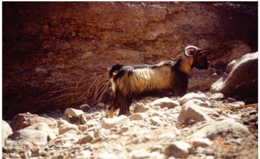
Fig. 12. Goats are competing with tahr for grazing ground.

forced it would cover many issues of wildlife conservation and protection. There are no CITES laws prohibiting international trade in any of the endemic prey species i.e. gazelle and tahr. The Arabian gazelle was included in Appendix 3 of CITES in April 1976 but was deleted from this category the following year in July.