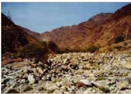
Fig. 10. Wadi bed in the Shumayliyah Mountains.