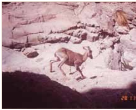
Fig. 7 and 8 Evidence of the occurrence of Arabian tahr in the Shumayliyah Mountains of the UAE. The image on the left is the single photograph obtained from a live sighting of tahr in Wadi Wurrayha. The image on the right is one of the 13 photographs of tahr obtained by camera traps during the Shumayliya Mountain survey carried out by the BCEAW between June 2000 and January 2002.

moisture requirements from prey (Skinner & Smithers 1990), some prey species occurring in the UAE, such as the tahr, are water dependant. Water could therefore be considered a limiting factor for the occurrence of Arabian leopard.