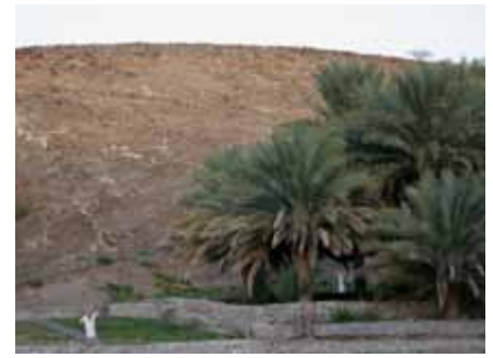
Fig. 5. Widespread farming now occurs in the mountains.

Local residents are known to have limited interest and awareness of the natural history of the UAE. A popular pastime enjoyed by both locals and expatriates in the region is “wadi-” and “dune-bashing”, which requires careful attention. Aside from the impact of noise and disturbance on the habitat, problems such as plant and animal destruction, erosion and pollution have a negative impact on these fragile habitats.