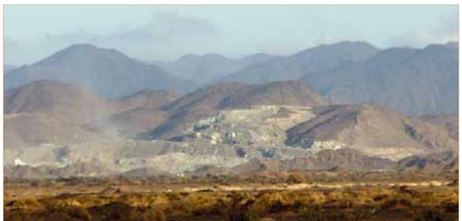
Fig. 6. Destructive impact of quarrying for the construction of multiple off-shore residential and pleasure islands along the UAE coastline. This quarry is situated near Wadi Shawka.

Whilst the leopard itself is said to be independent of water and able to obtain