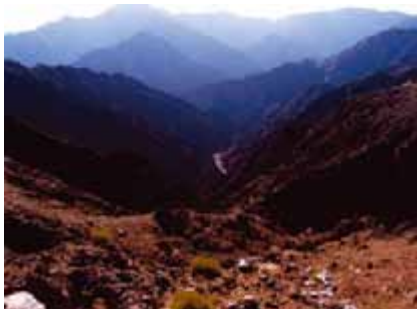
Fig. 9. Mountain habitat of the UAE.

No compensation system for losses of livestock exists within the UAE. No-