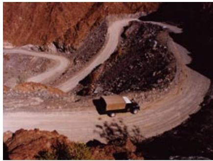
Fig. 4. Construction of roads allows access to remote areas.

Hunting and increased livestock numbers have resulted in a decrease of natural prey species, such as Arabian tahr Hemitragus jayakari . During a survey conducted by the BCEAW at perennial water holes of various wadi branches in the Shumayliya Mountains (B in Fig. 1) it was confirmed that Arabian tahr do still occur in the region but in very limited numbers. The survey, which was conducted between June 2000 and January 2002, included camera trapping, behavioural observations and faecal sample collection. During the 18-month period only thirteen photographs of tahr were obtained (Ruddock 2002, Ruddock & Smith 2002). There were five live animal sightings (Ruddock & Smith 2002) one of which was photographed (Fig. 7).