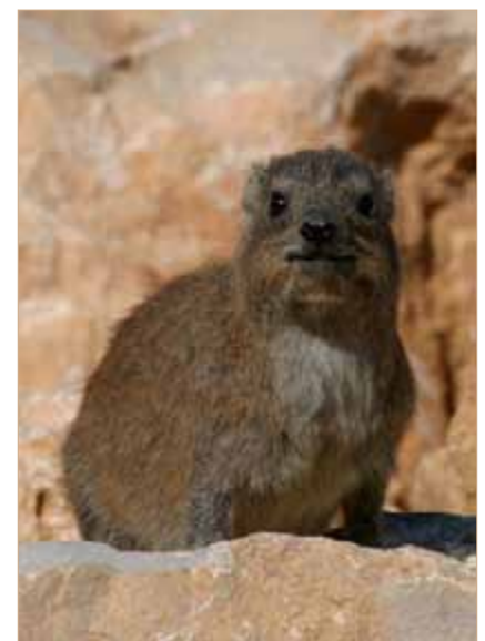
Fig. 11. Rock hyrax, a potential prey species for leopards in the Jebel Hafit.