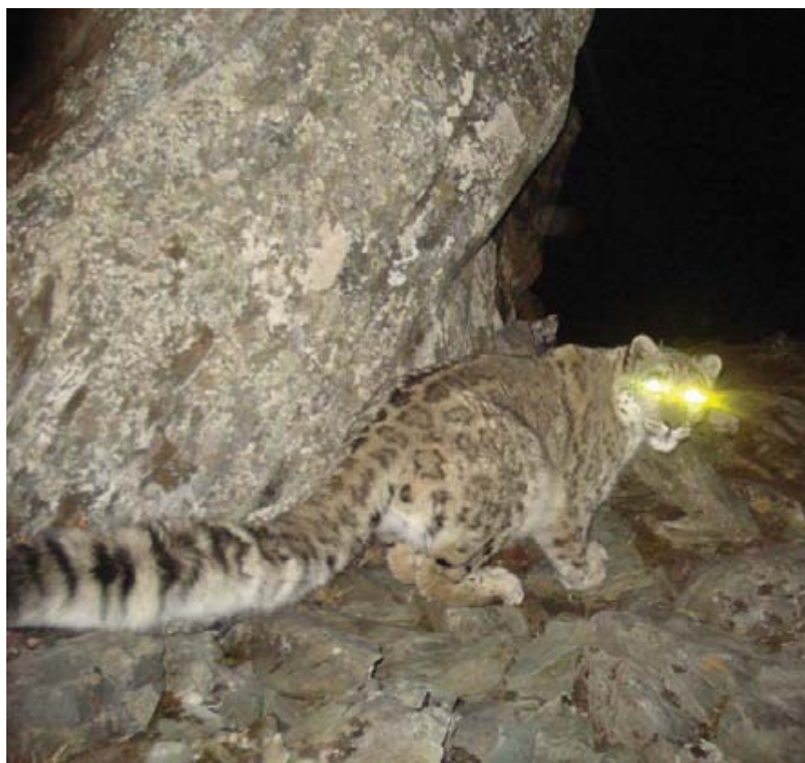
Fig. 1. Snow leopard photographed in Sichuan in the Qionglai mountains in Wolong National Nature Reserve, January 2009 (Photo Li Sheng, W. McShea & Wang Dajun).

Snow leopards are opportunistic predators, employing short-range hunting techniques, relying on camouflage and stealth, more suitable to the rugged mountain habitats than longer-range hunting methods. They are capable of taking large prey, up to three times their own body weight, but also show dietary plasticity, as would be expected in the harsh environments in which they exist, and will often take much smaller prey such as marmots and galliform birds. Livestock