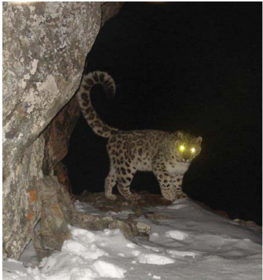
Fig. 3. Snow leopard photographed in Sichuan in the Qionglai mountains in Wolong National Nature Reserve, March 2009.

Within the SLSS, snow leopard range states were also encouraged to develop their own