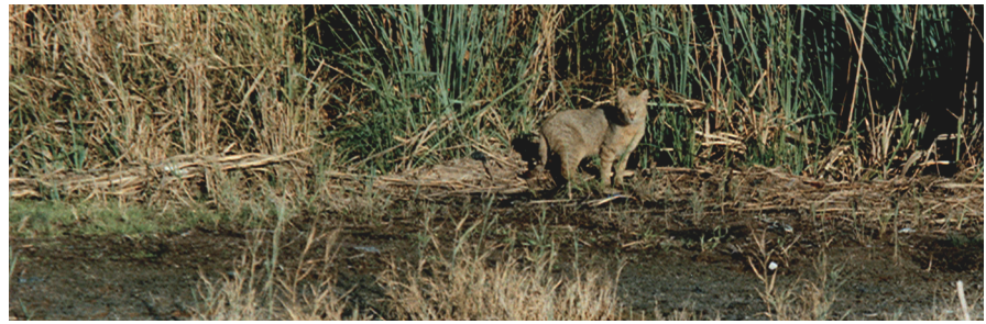
Fig. 4 A jungle cat in its natural habitat on the coastline of the Zarivar Lake, Kordestan Province.