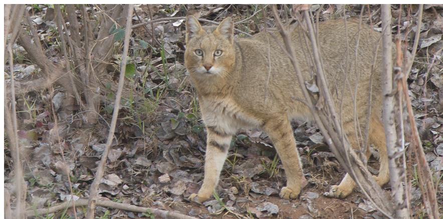
Fig. 1 A jungle cat in Mianroud, Khuzestan Province in the south-west of Iran in 2012.

We classified data into 3 categories: C1 as confirmed presence, C2 as probable presence and C3 as unconfirmed presence (suggested by Moqanaki et al. 2010). Confirmed presence includes photos, videos, injured individuals and carcasses or remains of the species obtained and recognized. Probable presence includes presence records reported by trained people, e.g. park rangers, other DoE staff or wildlife experts. Unconfirmed presence are observations that have not been confirmed by a trained person. Historical occurrence of the species is linked with records provided in old reports and unpublished records of the DoE. We used the records provided by Etemad (1985), Darvish (2001) and Sanei (2007) for historical occurrence of the species. These four main sources (i.e. C1, C2, C3 and historical occurrence of species) were used to map the current and historical distribution of the