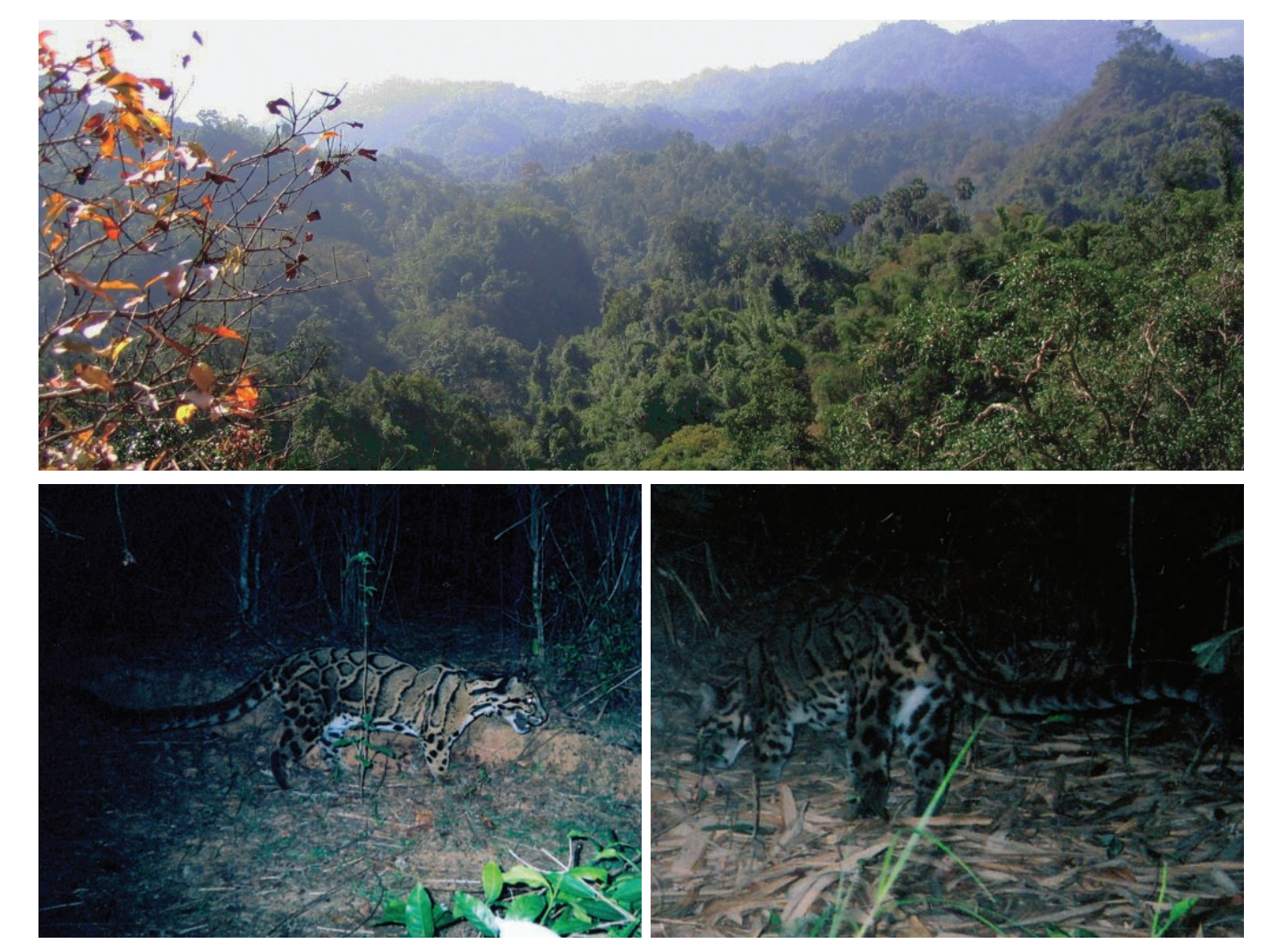
Fig. 2. From top to bottom: Evergreen broad-leaved forests are among the typical clouded leopard habitats. Camera trap pictures of a clouded leopard taken in May and June 2005 in the Nangunhe Nature Reserve in southwest Yunnan, China.