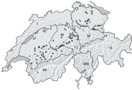
Figure 2: Information about reproduction from three different sources: chance observations = triangles, dead lynx or lynx removed from the wild = stars and opportunistic camera-trapping = squares.

Slika 2: Informacije o reprodukciji iz treh različnih virov: naključna opažanja = trikotniki, mrtvi risi ali risi odvzeti iz narave = zvezde in oportunistični posnetki s foto-pastmi = kvadrati. Table captions.