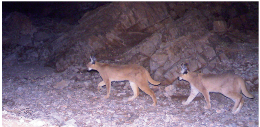
Fig. 4. A pair of caracals photographed in Darband-e Ravar Wildlife Refuge, Kerman Province, in February 2014 (Photo ICS/DoE/CACP/Panthera).