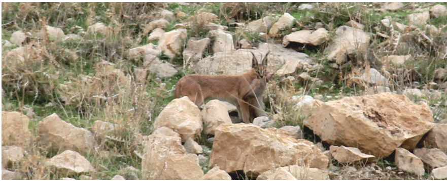
Fig. 5. A caracal photographed in Khaeez Protected Area, Kohgiluyeh-va-Buyer Ahmad Province, in February 2013, preying on a mongoose.