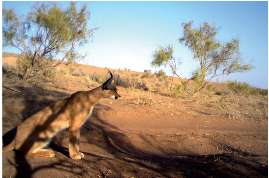
Fig. 3. A camera-trap photo of a caracal from Miandasht Wildlife Refuge, North Khorasan Province, in October 2014.