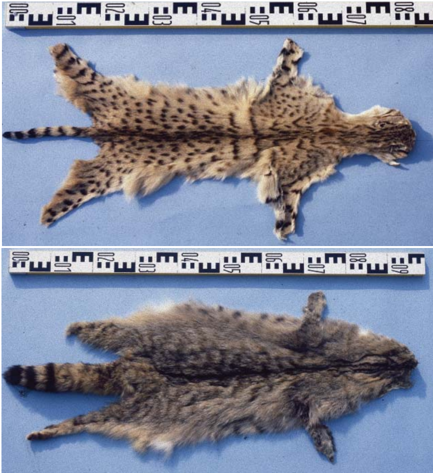
Fig. 1. The Asian wildcat (top) has a more brightly coloured pelage and clearer spots compared to the European wildcat (bottom), where faint spots often coalesce to a striped pattern and the fur is darker.

Wildcats of Central Asia Felis silvestris ornata have a light fur, ranging from greyish to sandy-yellow to reddish. They differ from other wildcat subspecies mainly in their distinct small black or red-brown spots (Fig. 1). The spots sometimes form transverse stripes or bars, especially on the legs and tail (Sunquist & Sunquist 2002). Such striped cats are most often found in the Central Asian regions east of the Tian Shan. The Asian wildcat has a long, tapering tail, always with a short black tip, and with spots at the base. The forehead has a pattern of four well-developed black bands. A small but pronounced tuft of hair up to one cm long grows from the tip of each ear. Paler forms of Asian wildcat live in drier areas and the darker, more heavily spotted and striped forms occur in more humid and wooded areas. The throat and ventral surfaces are whitish to light grey to cream, often with distinct white patches on the throat, chest and belly. Throughout its range